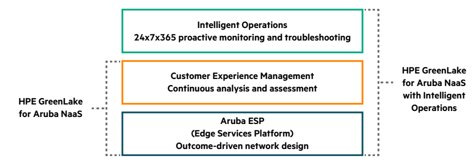
Figure 2. HPE GreenLake for Aruba offerings

Instead, HPE GreenLake for Aruba NaaS with Intelligent Operations leverages the industry-leading AlOps capabilities of Aruba to proactively monitor and remediate issues, avoiding customer impacting events before they occur and ensuring your Aruba technology is operating optimally to meet your business needs. HPE GreenLake for Aruba NaaS with Intelligent Operations also expands what's available to you in ASM, including tracking current/resolved incidents.